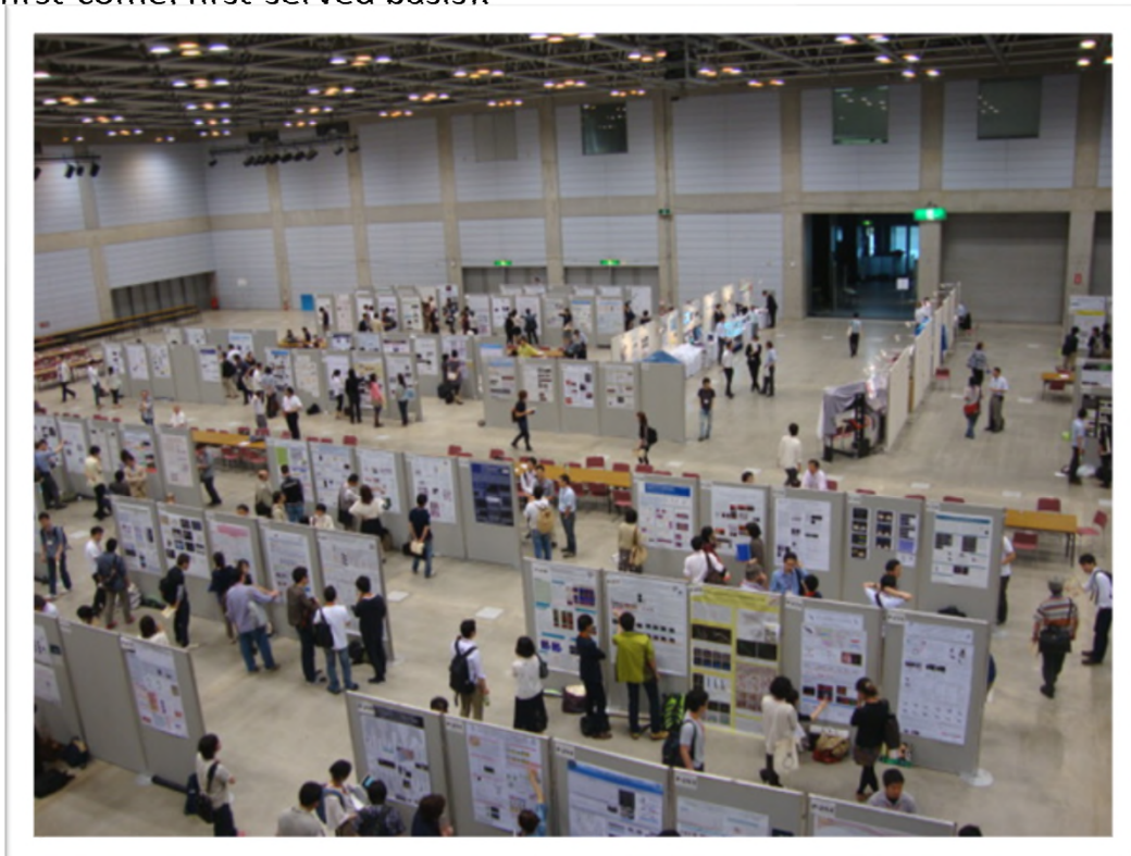
Large Exhibition Hall

Exhibitor who makes reservation earlier than 25 Apr. 2025 is given a prime position (on a first-come, first-served basis).