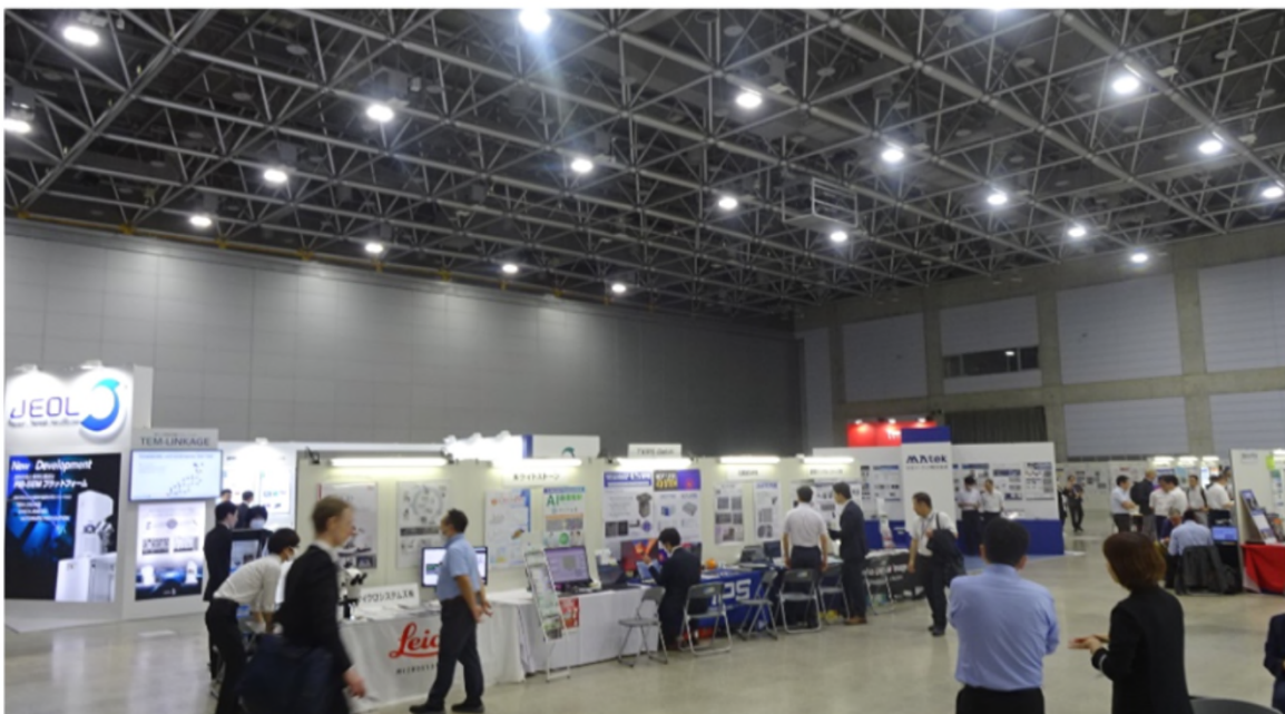
Large Exhibition Hall

* NOTE: All presenting authors must pay for a regular delegate registration and may not use an exhibitor registration to meet this requirement.